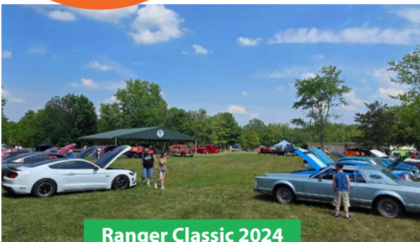
Ranger Classic 2024