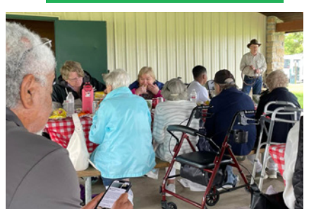
Senior Picnic in the Park