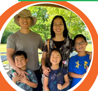
Father's Day Fishing