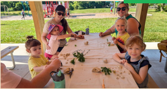
Summer Camps 2024