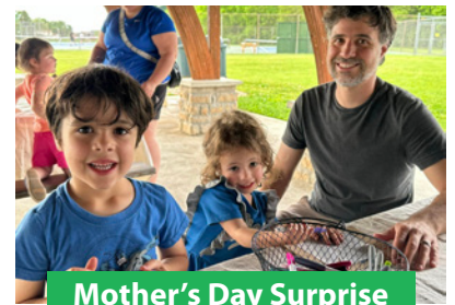
Mother's Day Surprise