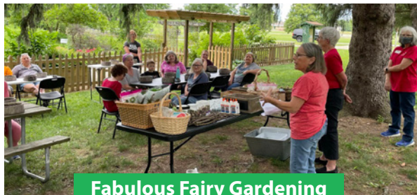
Fabulous Fairy Gardening