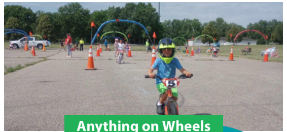
Anything on Wheels