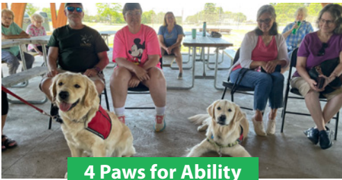
4 Paws for Ability