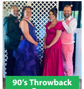
90's Throwback Prom