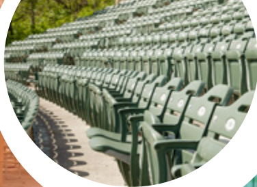
Caesar Ford Park