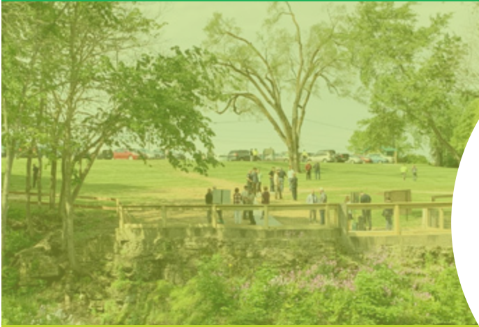
Indian Mound Reserve