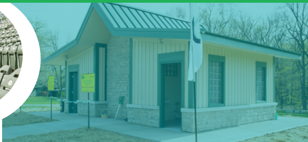
Russ Nature Reserve