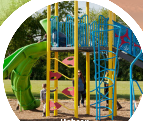
Hobson Freedom Park