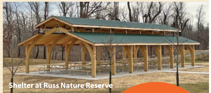
Shelter at Russ Nature Reserve